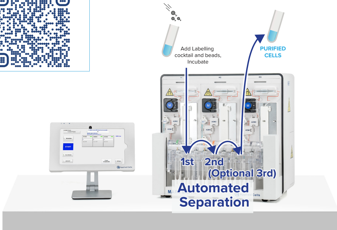
Figure 2. The MARS® platform offers an easy workflow for cells separation. A schematic showing a workflow: labeling protocol followed by two (or optionally three) MARS® Immunomagnetic isolation runs.

For research use only. Not for use in therapeutic or diagnostic procedures.